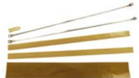
*2 upper teflons, 2 lower teflons, 2 heat elements